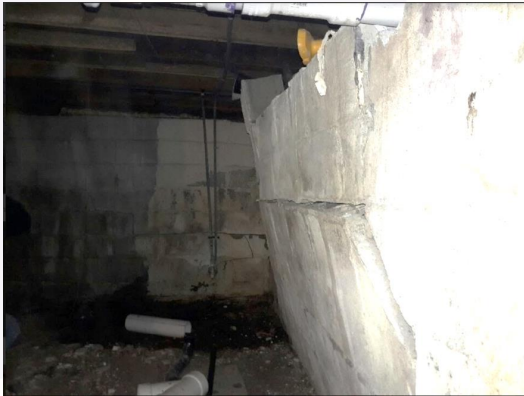
We Turn this....