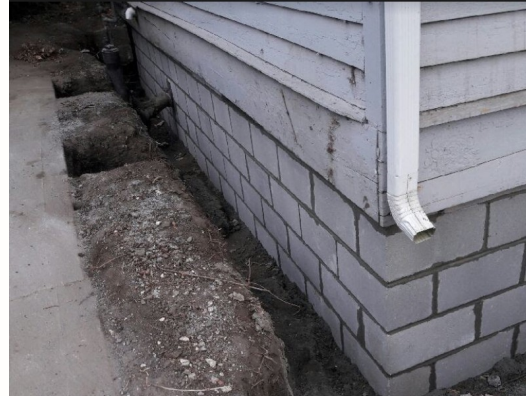
.... Into This